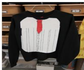
ELEGANT: to be graceful and stylish in appearance or manner.

If you google 'Vocabulary Parade' there are lots of other examples. Please see some examples below: