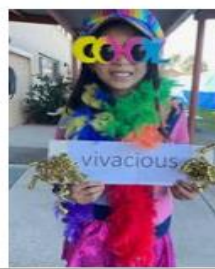
Vivacious: lively and animated.