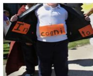
Incognito: concealing your identity.

We look forward to celebrating the English language and the wonderful books that have been created! Thank you for your continued support.