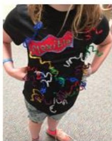
Flexible: bend without breaking.