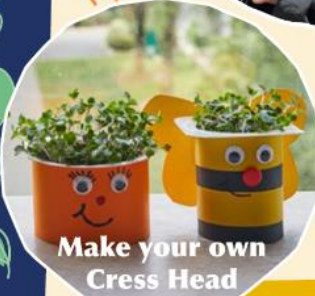
Make your own Cress Head