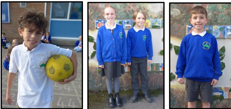
Some examples of correct school uniform (above) and correct PE kit (below).

We are having a drive on school uniform, to ensure we have consistent expectations of every child. We are really keen to instil pride in our pupils' appearance. Please ensure your child wears the following: Regular school uniform is school trousers or school shorts (not jogging trousers or jogging shorts) or a school dress/skirt, a white polo shirt and a royal blue jumper with black shoes. On PE days, children may come in wearing PE kit which is a plain white T-shirt and blue shorts with trainers. If it is cold, they may wear their school jumper and dark jogging trousers. If children are wearing an alternative to a school jumper, they may be given a jumper from lost property to wear. If you have any questions or face challenges in getting the correct school uniform for your child, please let Mr Ranger know so that we can arrange support for you. Many thanks for supporting us with this.