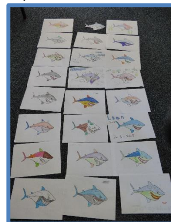
Right: Year 6 produce work on loan sharks