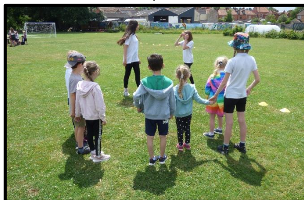
Year 6 Sports Leaders play host to Year 1.