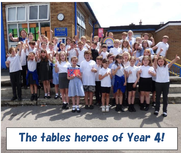
The tables heroes of Year 4!